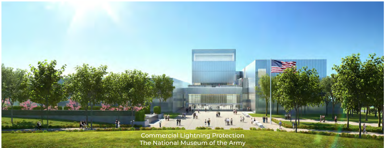
Commercial Lightning Protection The National Museum of the Army

Serving military, commercial and the industrial industries since 2009, Commercial Lightning Protection delivers turnkey lightning protection installation and solutions to customers in North Carolina, South Carolina, Virginia, Georgia, Washington, D.C. and Maryland.